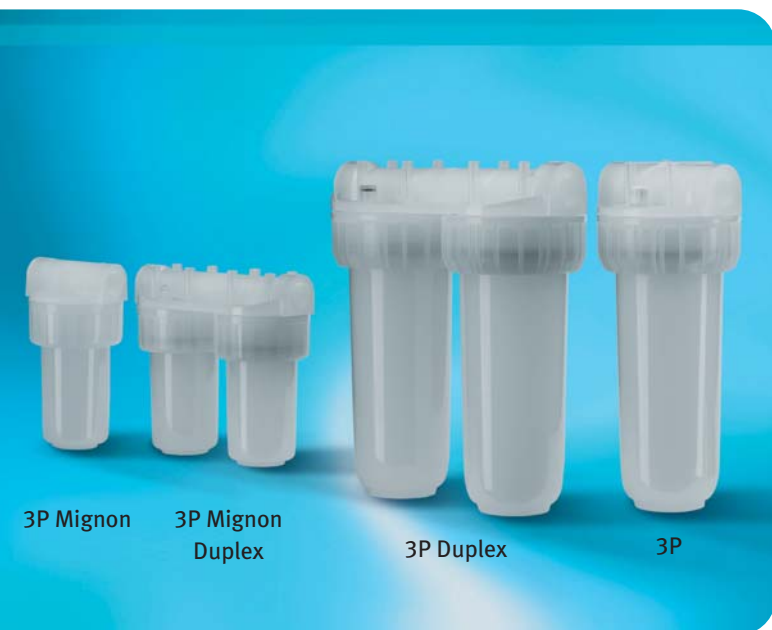
3P Mignon 3P Mignon Duplex

RO2-09/07. Subject to change without notice