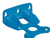
-S- wall bracket