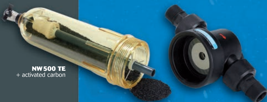
NW 500 TE + activated carbon

The activated carbon CINTROPUR is sold separately and is highly suitable for the improvement of taste and the removal of odour, chlorine, ozone, micropollutants such as pesticides and other dissolved organic substances.